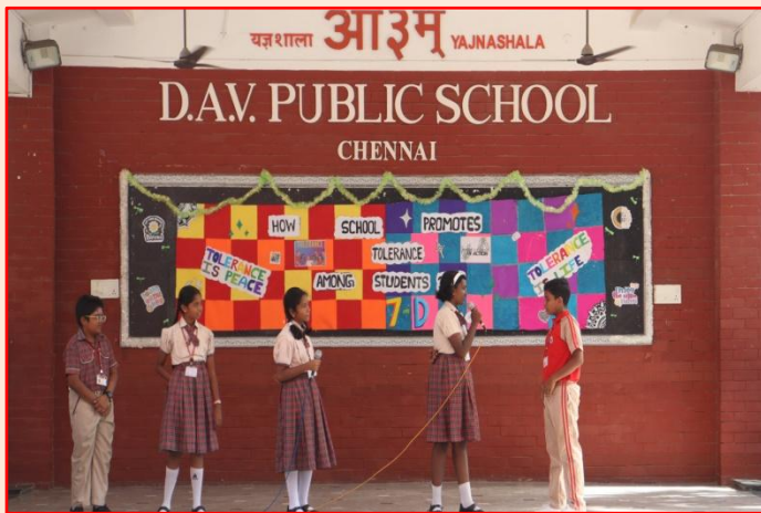
Tolerance Trivia – Tolerance in Everyday Life