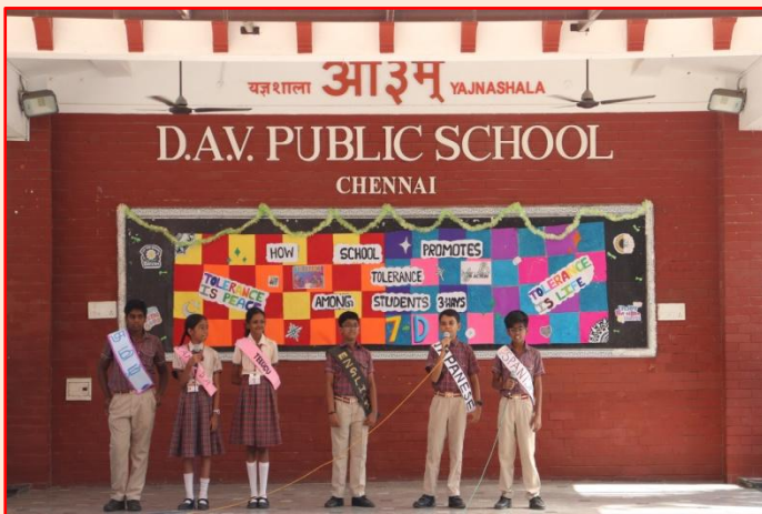
‘Language Mania’ – Embracing Linguistic Diversity