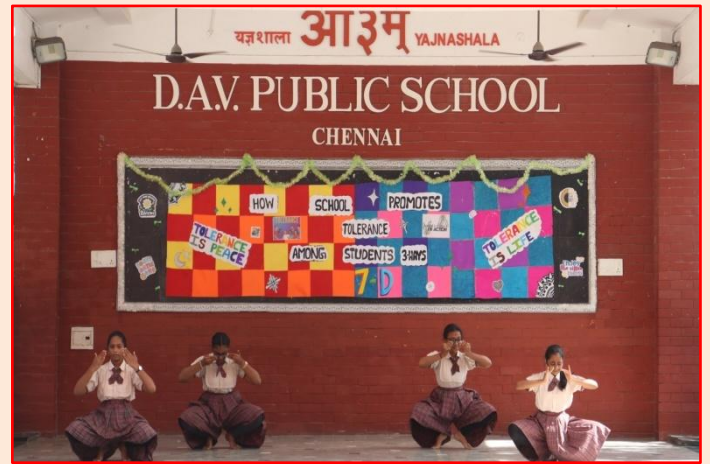
Beauty of Coexistence Emphasized through Steps of Harmony