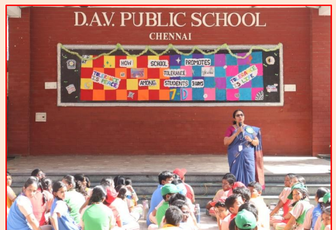
Reviews of the Supervisory Head