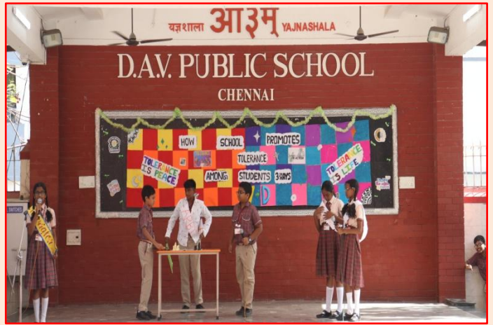
Symbolising Tolerance through Game of Chess